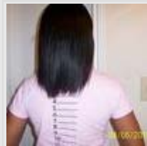
May Hair Update