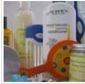
Natural Hair Care Products. Lots, and Lots of Products!