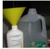
Friday, December 4, 2009 Got (Hair) Milk?