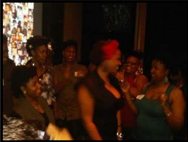
And the winner is... This flowered gem won best natural hairstyle for the night.